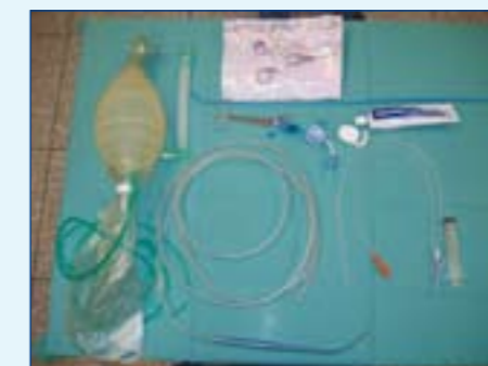
Figure 4. Essential bedside equipment: tracheostomy tube (same size and one size smaller), tracheal dilators, oxygen supply and Ambu bag, 10 ml syringe, suction catheters and source of suction.

means of communication such as pen and paper or cards with useful phrases on. Once the cuff is deflated, the tube can be intermittently occluded or a speaking valve attached to enable speech during exhalation, although this depends on a patent upper airway. Patients who have had a laryngectomy may in time be able to generate speech via a trachea-oesophageal puncture created at the time of surgery.