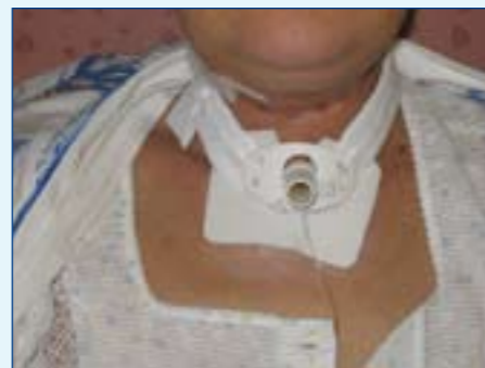
Figure 3. Different tracheostomy tubes.