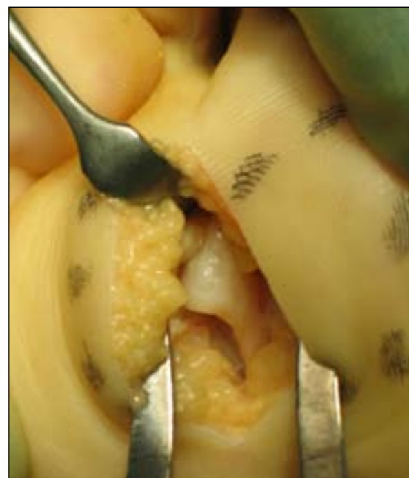
Figure 4. Enlarged interdigital nerve between the third and fourth metatarsal heads exposed through a plantar incision.

al, 1999; Mann, 1999; Coughlin and Pinsonneault, 2001). However, many patients have some residual discomfort in the region of the surgery and 70% still have some degree of footwear restriction (Schroven and Geutjens, 1995). For those who underwent the plantar approach this is usually attributed to wound healing problems, and for the dorsal approach to disruption and instability relating to the divided deep transverse intermetatarsal ligament, which normally functions to prevent splaying of the metatarsals and control the toes (Stainsby, 1997). There have been no direct comparisons but there does not appear to be any difference between the two approaches in terms of overall success. A thickened plantar scar may be painful, but usually settles after a few months, and only rarely requires scar excision and resuture.