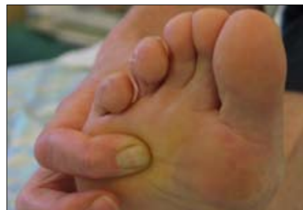
Figure 1. Patient indicating the site of pain between the third and fourth metatarsal heads.

toes or metatarsals should be considered. Radiation of the pain proximal to the forefoot is unusual and should raise suspicion of a more proximal condition, e.g. tarsal tunnel syndrome or even a prolapsed lumbar intervertebral disc.