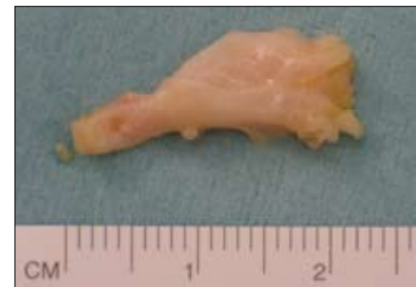
Figure 5. The excised specimen. The common digital nerve is at the left, and the bifurcation can be discerned at the distal part of the swelling to the right.

but both can miss small lesions. Conservative management can be helpful, but many patients opt for surgery. Debate continues as to whether a dorsal or plantar approach is better, with both at risk of complications, and mild persistent symptoms are not uncommon. BJHM