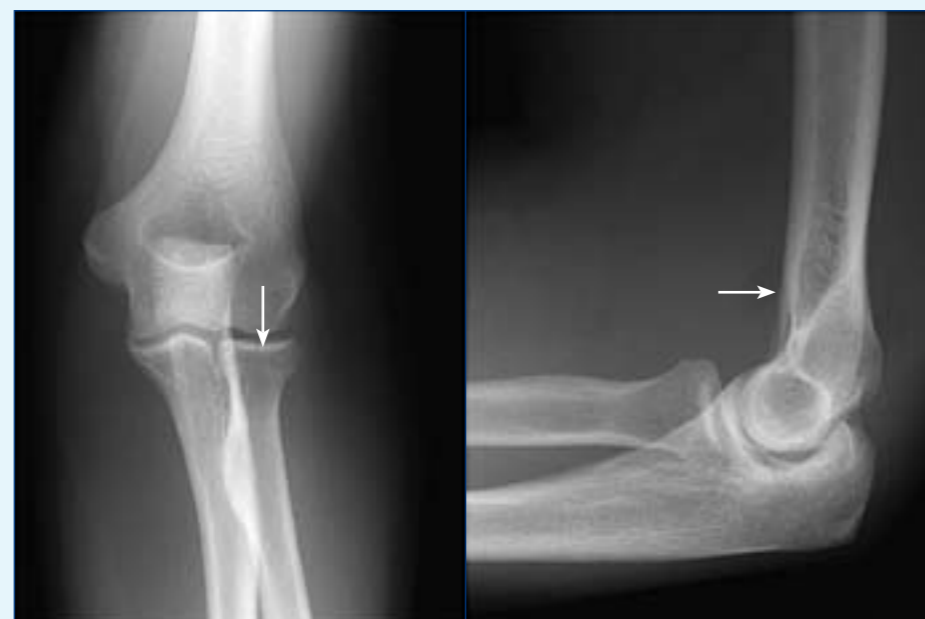
Figure 1. a. Anteroposterior radiograph of elbow showing undisplaced radial head fracture (arrow). b. Lateral radiograph of elbow showing fat pad sign (arrow).

Aspiration of the elbow in radial head fractures increases the speed of recovery, as a full range of motion is restored more quickly and patients are more able to comply with physiotherapy (Holdsworth et al, 1987; Dooley et al 1991). BJHM