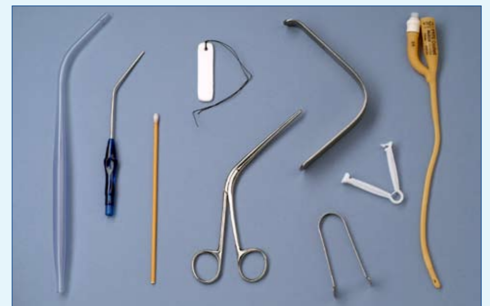
Figure 2. Basic ear, nose and throat equipment. From left to right: Yankeur sucker, Zollner sucker, silver nitrate stick, nasal tampon, Tilly's forceps, tongue depressor, thudicums speculum, umbilical cord clip, Foley catheter.

Nasal tampon insertion is indicated if you are unable to stop anterior bleeding, despite simple first aid measures or