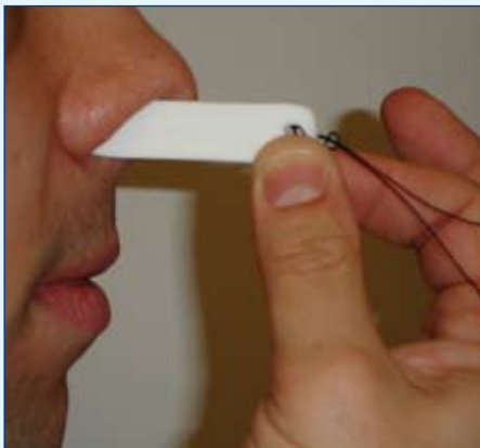
Figure 5. Correct angle of insertion of nasal tampon.

(Figure 6). This will prevent displacement of the pack into the oropharynx or airway. After packing, it is important to view the oropharynx to ensure that there is no active bleeding posteriorly (which may be present even if anterior bleeding appears to be controlled). If active bleeding posteriorly continues alternative packing should be considered.