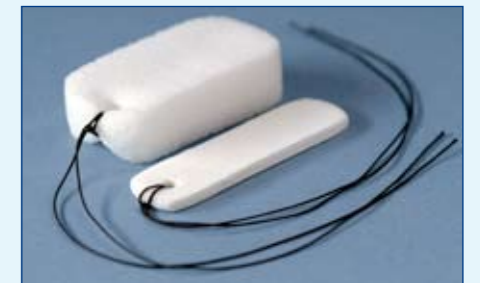
Figure 3. Nasal tampon before and after saline application.

cautery. It can also be used for posterior bleeding. The pack comprises a sponge which expands on absorption of liquid (Figure 3).