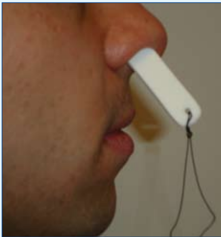
Figure 4. Incorrect angle of insertion of nasal tampon.