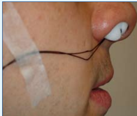
Figure 6. Nasal tampon inserted and secured.

Ribbon or BIPP (bismuth iodoform paraffin paste) gauze insertion using Tilley's packing forceps (Figure 2) is indicated in cases when nasal tampon insertion has failed. An assistant is recommended to support the head during insertion. As with nasal tampon insertion, the thudicums