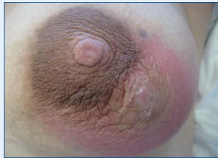
Figure 1. Central non-lactating abscess.

All patients should be offered analgesia. The abscess should then be classified to decide the optimal treatment. Pus can be aspirated