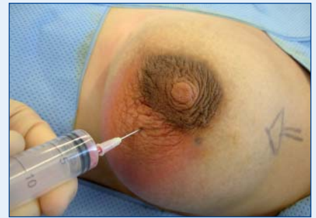
Figure 2. Pus being aspirated from abscess.

(Figure 2) using a white 19-gauge needle, either freehand or under ultrasound control if the facility exists, and sent for microbiological analysis. If no pus is aspirated, the aspirate should be sent for cytology. A management algorithm is shown in Figure 3.