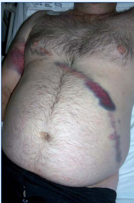
Figure 1. Seat belt sign.

As part of the primary survey, radiographical imaging of the chest and pelvis must be performed. Radiological clearance of the cervical spine can be delayed if the patient is cardiovascularly unstable. Large bore venous access must be secured and baseline blood tests requested: full blood count, cross-match, urea and electrolytes, and amylase. A urethral urinary catheter should be inserted unless there are clinical signs of urethral injury, i.e. blood at the external meatus, high riding prostate, scro-