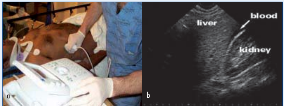
Figure 2. Focused Assessment with Sonography in Trauma (FAST). a. Probe position for left upper quadrant and the hepatorenal view. b. Blood shows as a hypoechoic black stripe on ultrasound, in this case between the capsule of the liver and the fatty fascia of the kidney.

tal or perineal haematoma. Urinalysis should be performed on everyone including beta-human chorionic gonadotropin (hCG) in females.