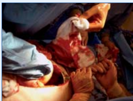
Figure 3. Packing of the abdomen to arrest haemorrhage.

For many years the concept of ‘hypotensive resuscitation’ has been well understood in the treatment of traumatic vascular injury and rupture of abdominal aortic aneurysms. Permissive hypotension describes the approach in which the systolic blood pressure is deliberately kept below the normal levels seen in health, with the aim of maintaining vital organ perfusion, in particular cerebral function, without exacerbating haemorrhage. Pressures greater than 80–90 mmHg are likely to dislodge a clot and lead to continued haemorrhage (Mattox, 2003). Hyper-resuscitated patients are more likely to re-bleed and go on to develop a coagulopathy leading to further problems in haemorrhage control.