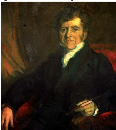
Figure 1. Portrait of Richard Bright.