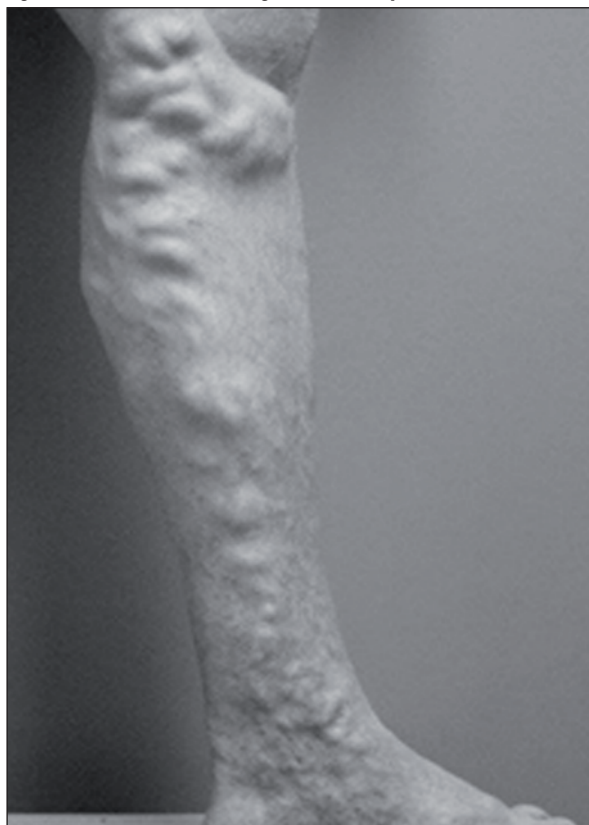
Figure 1. Varicose veins: enlarged tortuous superficial veins.

Compression stockings are contraindicated in peripheral vascular disease, so peripheral pulses should always be checked before prescribing them.