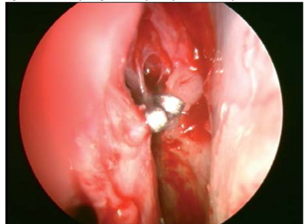
Figure 3. Endoscopic ligation of sphenopalatine artery.

Bleeding can be a result of overdose or loss of control, but can also occur in patients with an international normalized ratio (INR) within the therapeutic range.