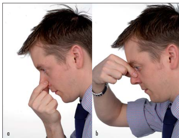
Figure 1. a. Correct Hippocratic method. b. Incorrect Hippocratic method.

Following the initial assessment and appropriate resuscitation, the Hippocratic technique should be performed for approximately 10 minutes. If bleeding continues, cotton wool soaked in a vasoconstrictor, e.g. xylometazoline or co-phenylcaine, should be applied inside the nose. If the bleeding stops, the nose should be examined using a torch or an otoscope. Any bleeding points seen should be cauterized using silver nitrate. The indiscriminate, non-specific use of silver nitrate cauterization should be discouraged, and only used when a specific bleeding point can be seen. If bleeding continues, or is severe, then referral to ear, nose and throat is appropriate ( Figure 2 ).