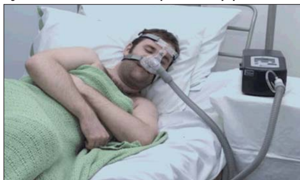
Table 6. Benefits of continuous positive airways pressure in obstructive sleep apnoea