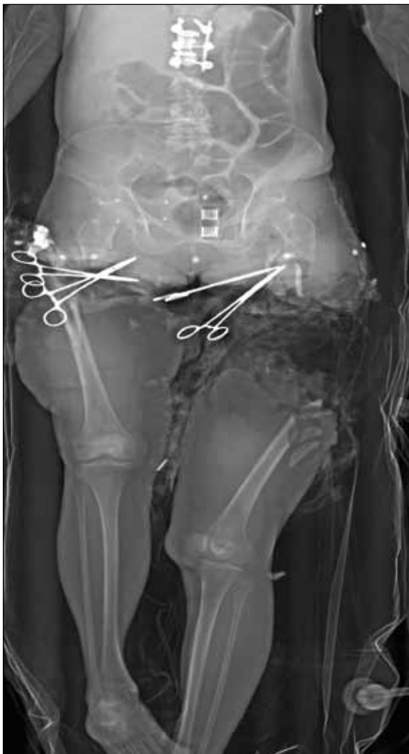
Figure 4. Antero-posterior Lodox Statscan view showing near amputation of the left lower extremity. In this case Lodox Statscan provided fast, safe imaging for diagnosing injury without interrupting life-saving measures.

magnify or zoom and window/level each individual bone and joint in an effort to detect distal extremity fractures, even though the Statscan system allows this. Subsequent imaging with other modalities may be needed if the trauma and orthopaedic teams require it for further assessment of the patient's suspected sites of additional injury.