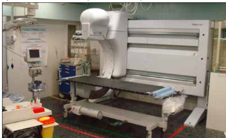
Figure 1. Lodox Statscan at Inselspital resuscitation bay.