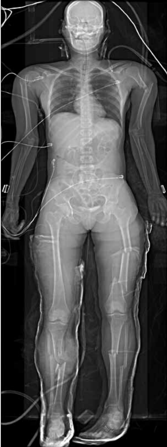
Figure 2. A whole body antero-posterior Lodox Statscan view, showing fractures of the right tibia, right fibula, left tibia, left fibula, left femur and left humerus.

The digital radiation dose relative to the conventional dose varies from 72% (chest) to 2% (pelvis), with a simple average of 6% (Parry et al, 1999; Beningfield et al, 2003). The radiation skin-entry dose averages 36 mrem (range 18–67 mrem), compared with a conventional dose of 591 mrem (range 20–2280 mrem) (Mervis et al, 2005). Effective doses are between 9% and 75% of the United Nations Scientific Committee Report on the Effects of Ionizing Radiation Doses for Standard Examinations (Irving et al, 2008).