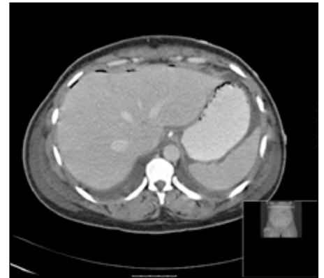
Figure 3. A transverse section of a computed tomography scan showing small bowel dilatation and intraperitoneal air between bowel loops.