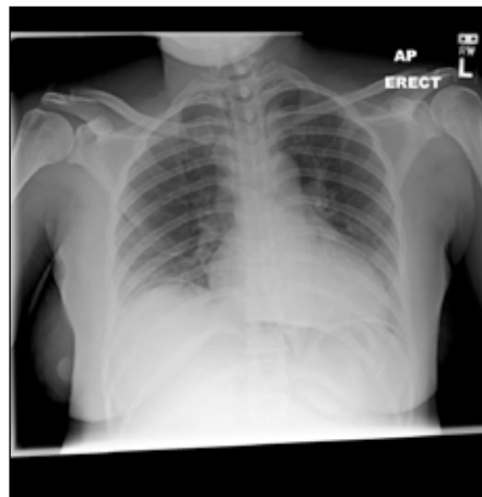
Figure 1. An erect chest X-ray taken on the fourth postoperative day demonstrating pneumoperitoneum.