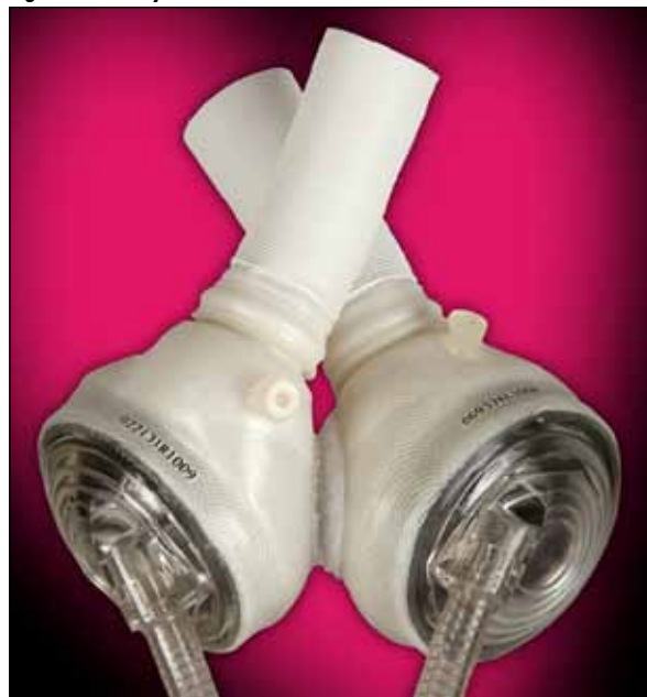
Figure 2. The SynCardia total artificial heart.

The first artificial heart to be used clinically was the Liotta total artificial heart, which was implanted in 1969 in a patient who was bridged for 48 hours to a heart transplant (Cooley, 2011). Now into the 5th decade since this milestone, over a thousand artificial heart devices have been deployed worldwide. The only device that is currently approved for use in Europe and the United States is the SynCardia total artificial heart (formerly Symbion Jarvik Heart). The SynCardia total artificial heart functions with two separate pneumatically driven pulsatile pumps which assume the role of the native ventricles and are powered by an external driver (Figure 2). The external driver pushes air in and out of the two artificial ventricles. Within each of the artificial ventricles, blood and air are separated by an impermeable diaphragm. Each ventricle also has two mechanical valves, one for inflow and one for outflow (Figure 3). During the ejection phase, a pulse of compressed air inflates the air chamber, pushing the diaphragm towards the blood chamber, thereby ejecting blood into the circulation. During the filling phase, a vacuum is applied to the air chamber, pulling on the dia-