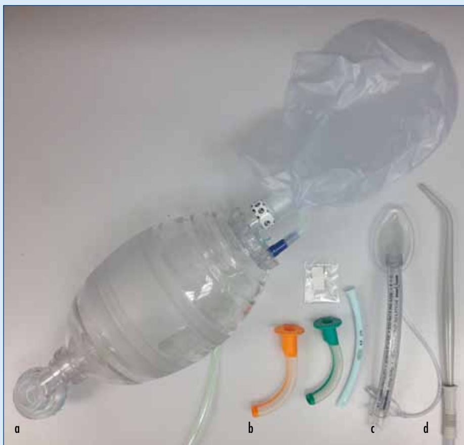
Figure 2. Adjuncts for supporting airway and laryngeal mask. a. Bag-valve-mask system with high flow oxygen source. b. Oropharyngeal and nasopharyngeal airways. c. Laryngeal mask. d. Wide-bore rigid sucker.

A secure airway is one in which the trachea and bronchial tree are protected from aspiration of gastric contents or secretions by the presence of a cuffed endotracheal tube (or a tracheostomy). This is the gold standard for an unconscious patient at risk of aspiration, but should only be attempted by those trained and familiar with the technique of tracheal intubation. This will