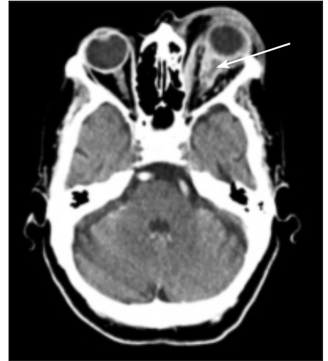
Figure 1. Retrobulbar haemorrhage extending into the optic nerve sheath of the left orbit (arrow).