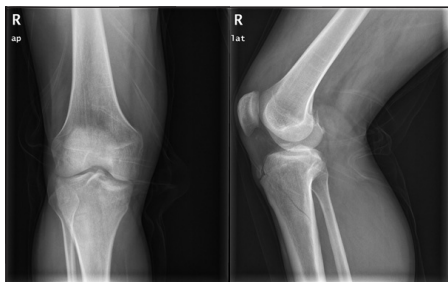
Figure 1. Anteroposterior and lateral film showing tibial plateau fracture and femoral condylar fracture.