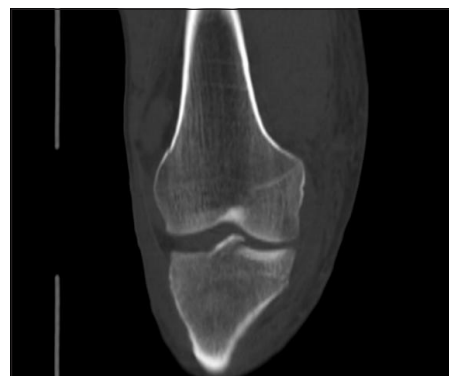
Figure 3. Coronal reconstruction computed tomography image showing supracondylar femoral fracture is non-existent.