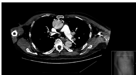
Figure 1. Computed tomography showing embolism of the left main pulmonary artery and right upper pulmonary arteries.