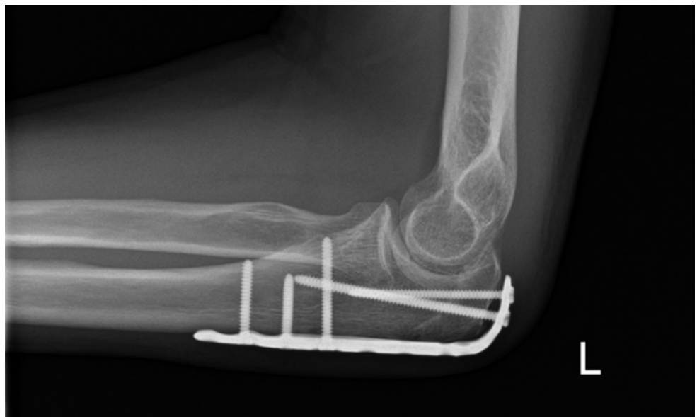
Figure 4. Lateral plain X-ray of open reduction internal fixation using locking plate.

While tension band wiring and plate fixation have different indications, several studies have directly compared tension band wiring and plate fixation specifically in patients with Mayo type IIA fractures. Duckworth et al (2017a) performed a randomised control trial of 67 patients and found no difference in patient-reported outcomes at 1-year follow up between the two treatments. These findings are corroborated by several systematic reviews (Ren et al, 2016; Rantalaiho et al, 2021). However, tension band wiring had a higher rate of metalwork removal compared to plate fixation. This is an important consideration when counselling patients about the benefits and risks of surgery.