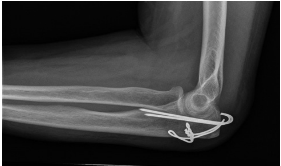
Figure 3. Lateral plain X-ray of tension band fixation of the olecranon.