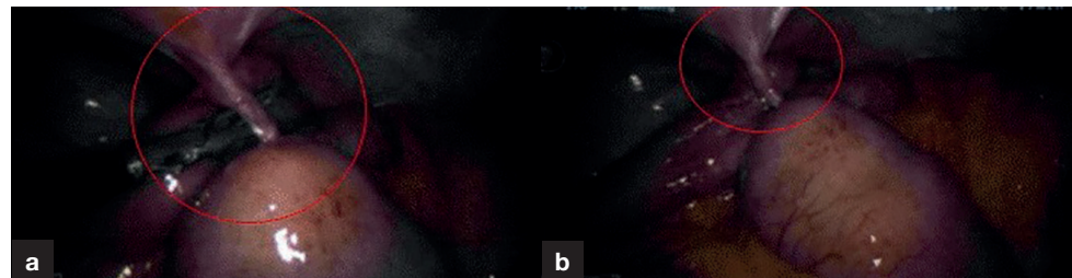
Figure 2. Intraoperative images showing a single fibrous band (circled) between the anterior abdominal wall and proximal ileum.

cases are reported in adulthood. Most of these presented in early adulthood, with very few cases in individuals as old as this patient (Sozen et al, 2012; Nicolas et al, 2016).