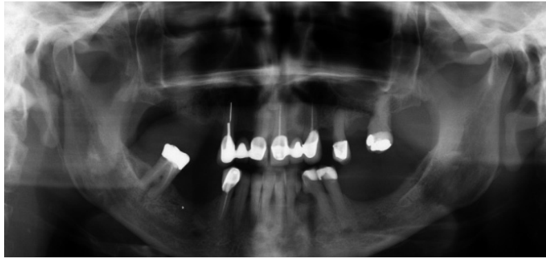
Figure 3. Orthopantomogram showing no evidence of dental infection or collection.

The patient presented the second time with cheek swelling, which suggested an odontogenic infection. Therefore, magnetic resonance imaging was preferred to computed tomography, contrary to usual management of neck abscess, to better evaluate the fascial spaces and oral muscles.