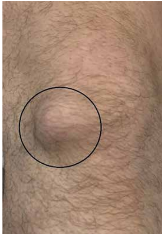
Figure 1. Visible swelling on the lateral knee.