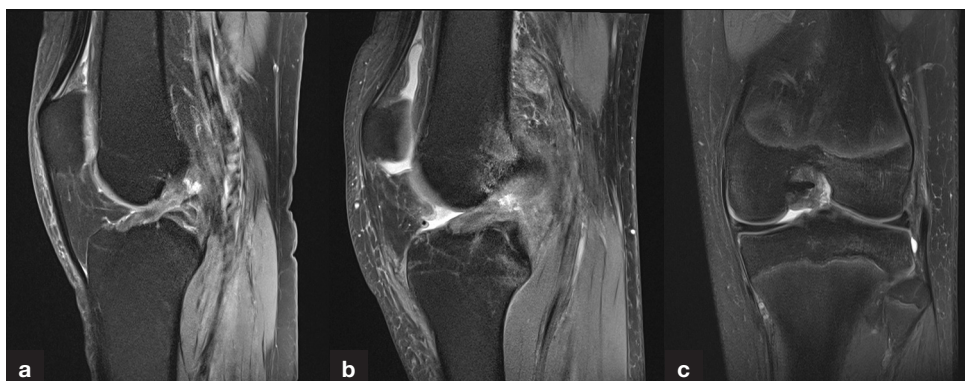
Figure 3. Magnetic resonance imaging of the left knee. a. Sagittal view demonstrating a mid-substance anterior cruciate ligament tear. b. Sagittal view demonstrating a proximal anterior cruciate ligament tear. c. Coronal view demonstrating a proximal anterior cruciate ligament tear.

Plain radiographs, consisting of antero-posterior and lateral views, are used to exclude other pathologies, such as fractures or degeneration. Soft tissue swelling and joint effusion may be present (Abbod et al, 2018).