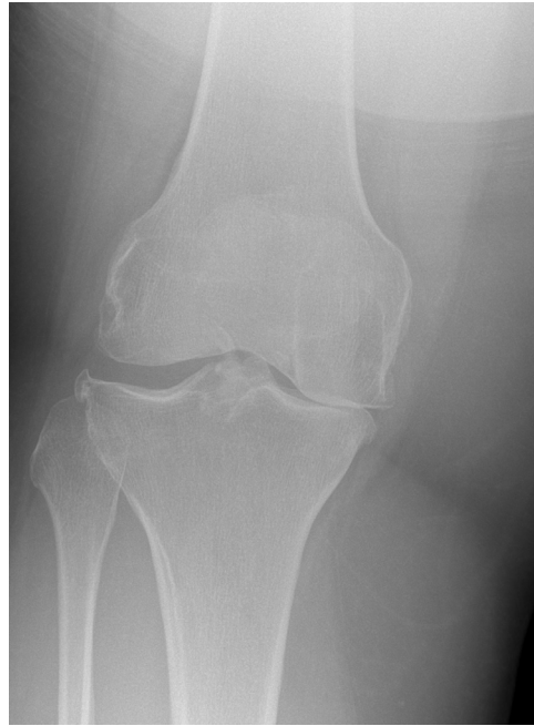
Figure 4. Radiograph demonstrates joint space narrowing, subchondral sclerosis and osteophyte formation especially of the medial compartment in keeping with osteoarthritis.

Pharmacological interventions include analgesia, topical treatments or intra-articular corticosteroid injections often performed under ultrasound guidance. Non-steroidal anti-inflammatory drugs reduce both pain and inflammation. Intra-articular corticosteroid injections provide targeted pain relief, often lasting several months (Mora et al, 2018; National Institute for Health and Care Excellence, 2022b).