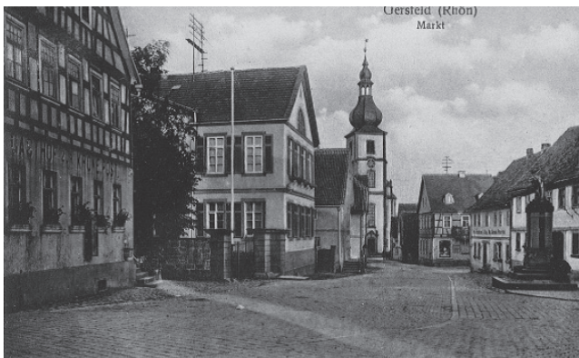
Fig. 1: Market square in Gersfeld (Rhoen) (most likely in the early 1920s). Postcard (Verlag Louis Schuessler, Gersfeld) from the private collection of the author.