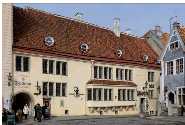
Fig. 3: Raeapteek in 2021.