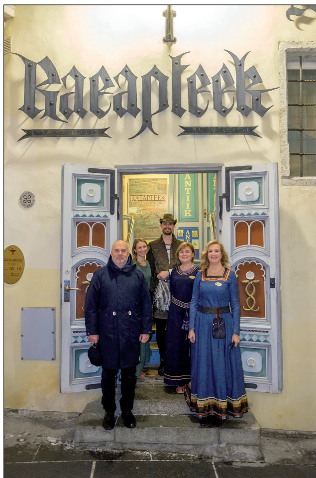
Fig. 5: President of the Republic of Estonia Alar Karis and staff of the Raeapteek on 21 December 2021.

The major anniversaries of the Raeapteek were celebrated in 1922 and 1972 when a number of printed publications were issued and souvenirs produced. Because of the respectability of the Raeapteek and the role of claret in socialising, the oldest pharmacy of Estonia also had a social significance and an important dimension in cultural history. The Raeapteek played an essential role in the establishment of the current Estonian History Museum; the Estonian pharmaceuticals factory, K. C. Fick’s faience manufactory and other dignified institutions had their beginning at the pharmacy. The first nature photography exhibition and the first art exhibition in Estonia were arranged in the rooms of the Raeapteek, and the Estonian Chamber Music Society was founded there. During Burchart VII, Isis, the first Freemasons lodge in Estonia, found its home there. Now, the pharmacy functions hand-in-hand with the museum which is supported by the city of Tallinn (Raal 2022).