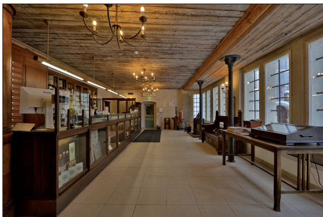
Fig. 4: Officina of Raeapteek in 2021.

imately 110 × 66 × 85 cm. One of them has the inscription “HB: Millefolii ” (abbreviated yarrow herb) and the number 32, the other “HB: Viol. Tricolor ” (wild pansy herb) and the number 47. So there must have been at least this many medicinal plant storage boxes at one time. The capacity of such drug boxes is impressive. Each rental agreement with the apothecary also addressed requirements for the collection of medicinal plants and the storage of drugs (Ruben 2013; Raal 2022).