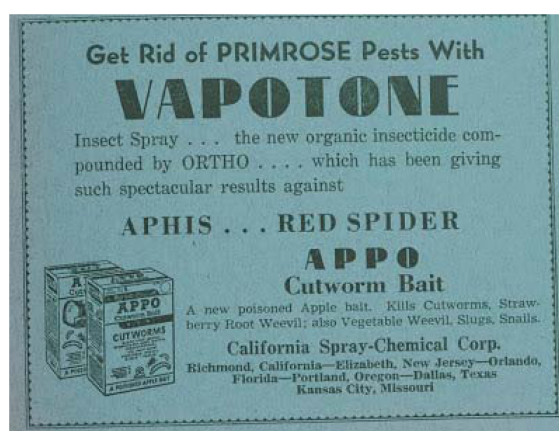
Fig. 1: Early ad for TEPP produced by ORTHO and marketed as Vapotone ® by California Spray and Chemical Company (Cal Spray), a predecessor of Chevron Chemical Company.