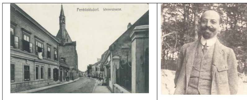
Fig. 5: Wilhelm Stadler (1880–1967). Photo of Wilhelm Stadler kindly provided by the family (Ruth Lelior).