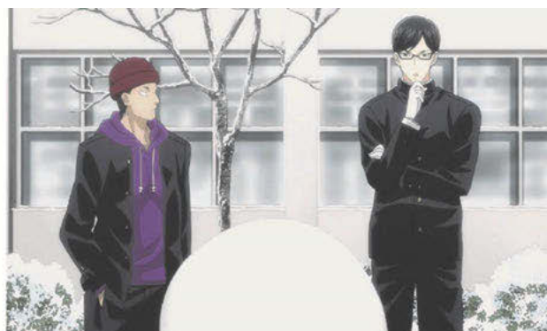
Figure 1. Screenshots of Mushi-shi (2005) and Haven’t you heard? I’m Sakamoto (2016), from left to right.