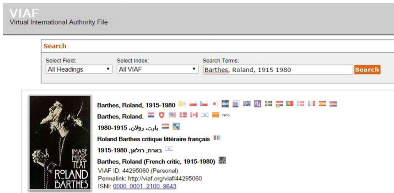
Figure 6. Authority record—Barthes. http://www.viaf.org/viaf/44295060/#Barthes,_Roland .

sions in the twentieth century, with Barthes's previously mentioned work about the alleged "death of the author."