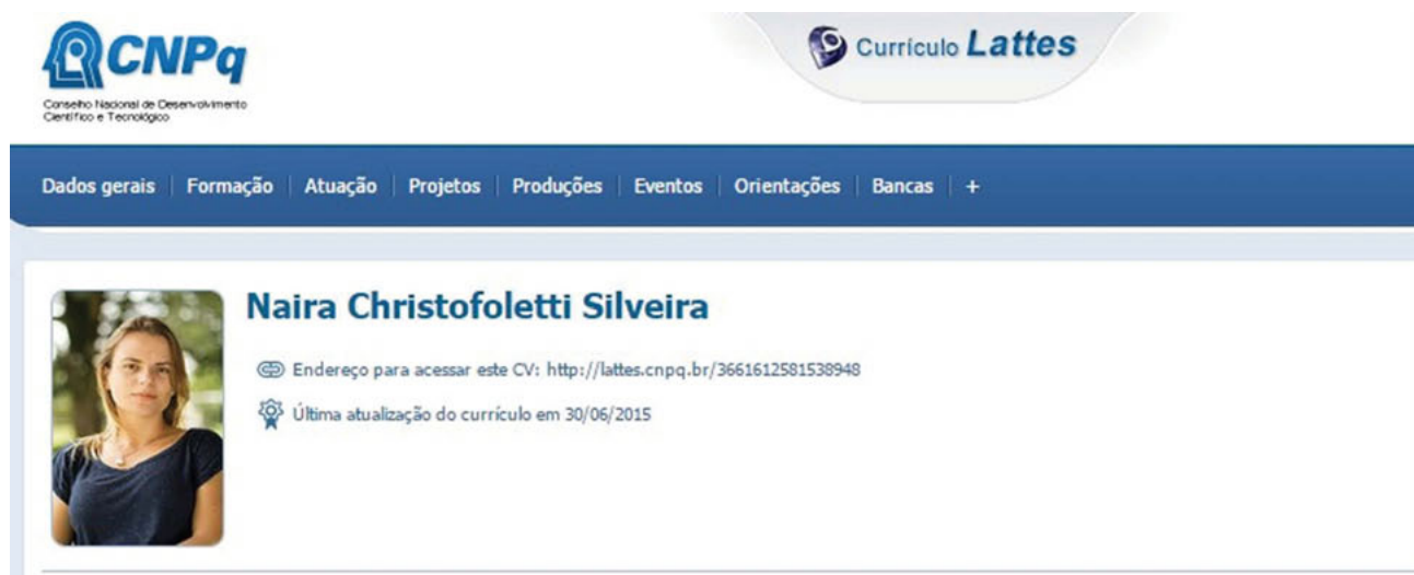
Figure 5. Sample of Plataforma Lattes—CNPq. http://lattes.cnpq.br/ .

ety”) is closely related to language games which manipulate names and images of faces, profiles, etc. As early as 1934 Otlet stressed the need of certain authors to relate their names to photographs (pictures) in books. Along with the identification of movements that intend to enhance the difference between representing the author of a document (information representation) and the author as access point (knowledge organization), it is possible to ascertain the difficulty of matching the documental representation with its large volume of documental production and the necessity of feeding databases. Such a “selfie society” is already “manifested” in knowledge organization, but with the flaws and challenges of the current cultural changes. A typical example is the aforementioned VIAF case. It is a