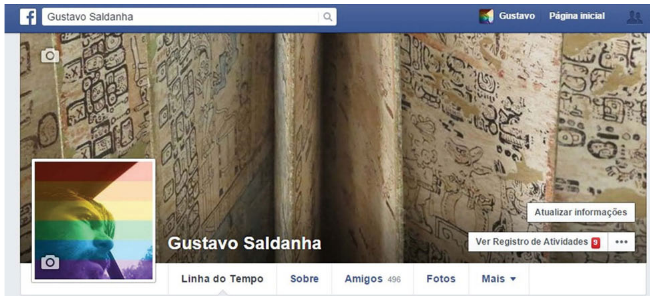
Figure 4. Sample of Facebook profile. https://www.facebook.com .