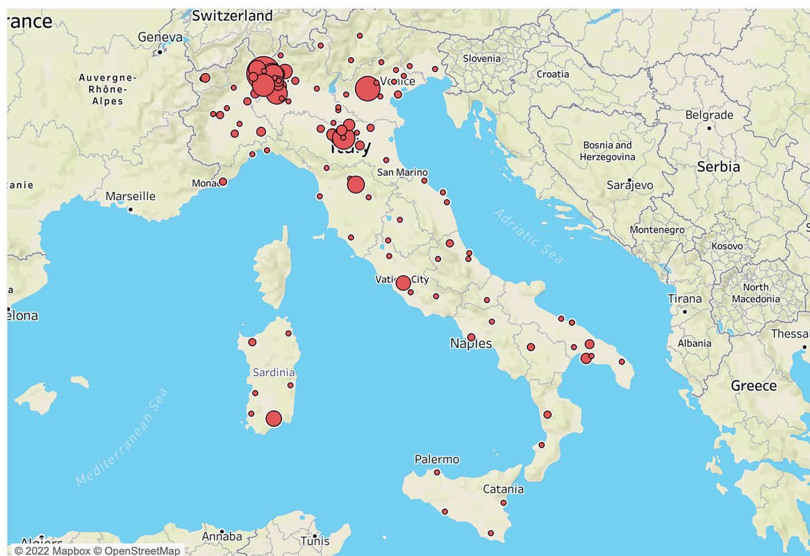
Fig. 1. Proportional circle map showing where participants came from.

ables taken into account in this analysis were: (a) age, (b) years of work, (c) number of stillbirths assisted, (d) presence in the hospital of a specific protocol and (e) personal training on stillbirth management.